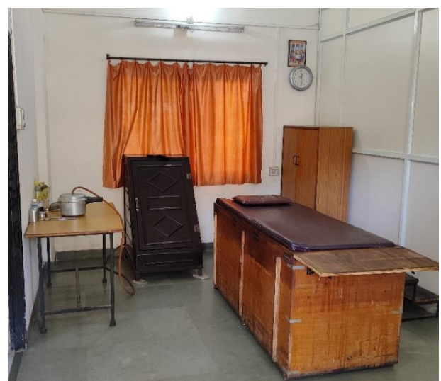
Panchkarma room at Ashakiran

Used for: Hyperacidity, headache, epistaxis (nosebleed), skin disease, eczema, psoriasis, vitiligo, urticaria, leprosy, elephantiasis, recurrent abscess, hepatitis, jaundice, paralysis, piles, chronic fever, worms, gout, goitre, anaemia, obesity; burning of palm, sole, eyes; male infertility